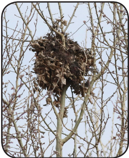
Squirrel's nest in a tree