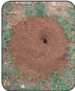
Anthill or ants