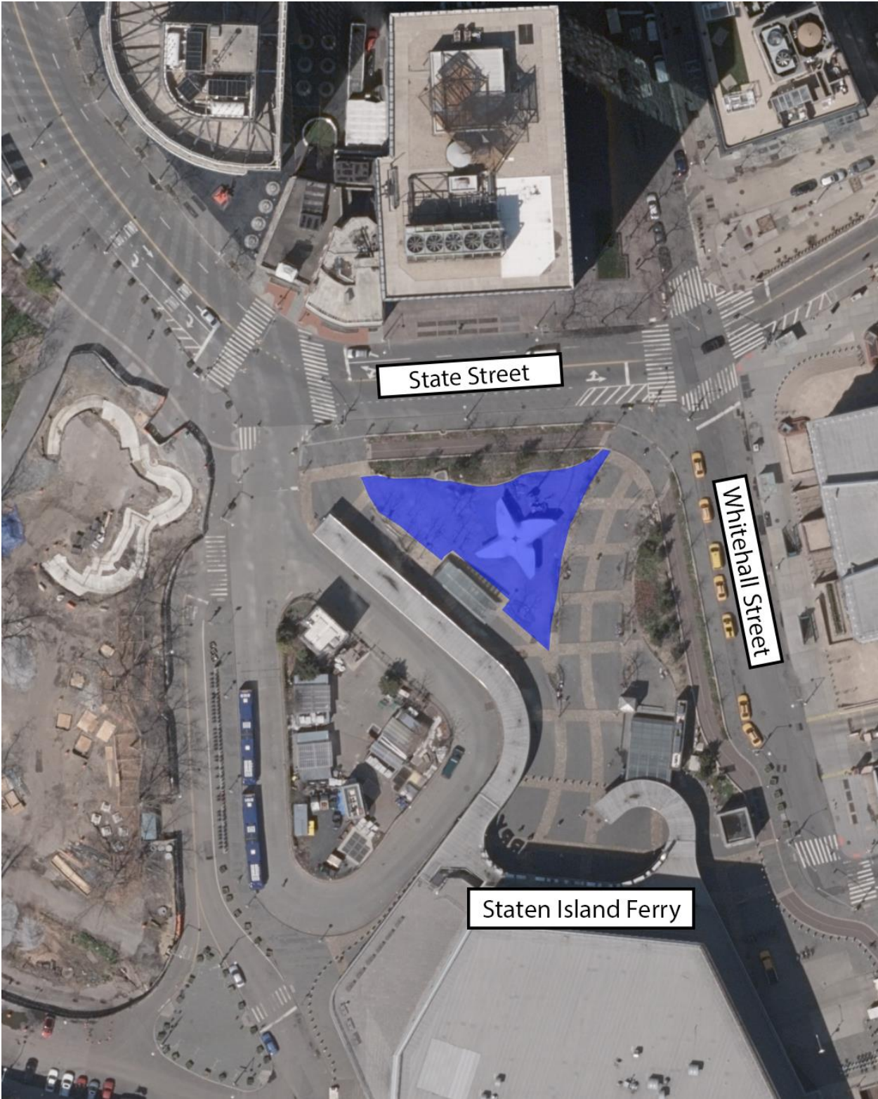
EXHIBIT C: New Amsterdam Plaza and Pavilion Licensed Premises